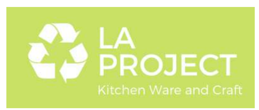
Picutre 3. Business logo

This LA Project will later be targeted as a small and medium-sized business whose production intensity: More than 20 employees with worker specifications (10% of which will be filled by experience in making handicraft/handicraft products) and can hook the high demand for increasing domestic products every year until it continues to increase significantly.