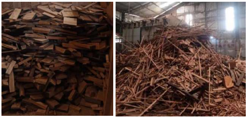
Picture 1. Furnitur Industry waste

The number of competitors with different uniqueness becomes the main challenge that makes business actors rack their brains to run their businesses. So it is necessary to develop a strategy, choose and place any market share, and the correct basis in marketing the product. Due to the high production of furniture and the demand for furniture in the domestic and international markets, each furniture manufacturer is competing in achieving their respective quantities because this also causes an increase in production waste. There are several wastes produced by the furniture/furniture product-producing industries, which are divided into three, namely solid wood waste, coarse or fine powder waste, and other waste produced, namely smoke and ash as a result of burning wood to produce hot steam for steam and ovens.